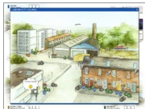
Interactive scene painted in water colour

“Scenario was fantastic – made things very clear about how [waste management] works”